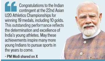
- PM Modi shared on X

“Congratulations to the Indian contingent at the 22nd Asian U20 Athletics Championships for winning 19 medals, including 10 golds. This outstanding performance reflects the determination and excellence of India's young athletes. May these achievements inspire many more young Indians to pursue sports in the years to come.”